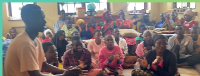
DEC'22 WORK PARTY